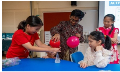
Science lesson with Foshan students