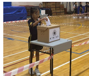
A student casts her vote at one of the polling boxes