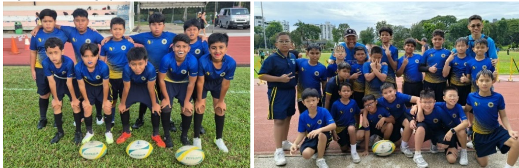
Figure 9 – Rugby Senior and Junior Team

15. Primary One Registration . The P1 Registration Exercise was completed in phase 2C with all vacancies filled. The overwhelming response during registration reflects parents' strong confidence in our educational programmes and values. We thank all parents and students for your trust and support.