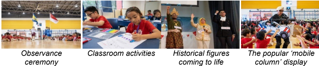
Figure 6 – Highlights from National Day Celebrations

10. Important Dates to Note for September and October. Please refer to Enclosure 1 for the early dismissal days and non-reporting days for P1 to P6 students in September and October.