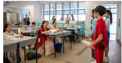
Classroom observation during school tour

9. Building Civic Literacy. Our school's approach to developing civic literacy focuses on nurturing students' understanding of Singapore's identity, respect for diversity, and commitment to community contribution. This is achieved through the CCE curriculum, anchored on three key concepts of Identity, Relationships, and Choices. Learning is reinforced through various platforms such as National Education commemorative events, cohort-based activities and learning journeys, school assemblies and special programmes, and school-based initiatives promoting student agency and leadership. Several of these events were organised this term.