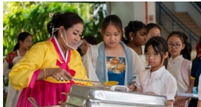
Foshan students sampling traditional ethnic snacks