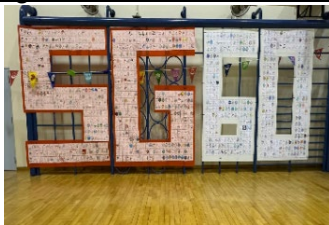
SG60 Tapestry Board