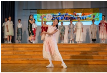
Dance and song item by Foshan students