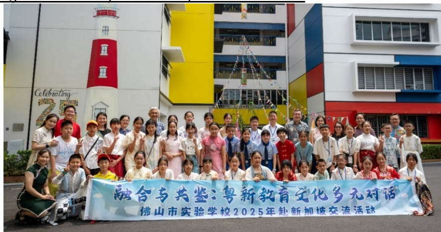
Delegation from Foshan Experimental School