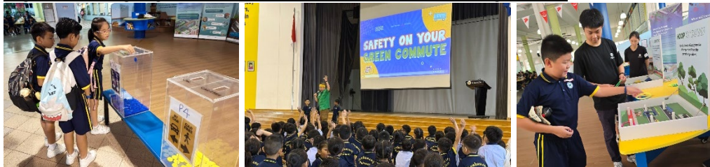
Figure 1 – Highlights from Transport Ambassador Programme

7. Transport Ambassador Programme (TAP) . In collaboration with the Land Transport Authority (LTA), the school organised the TAP to promote sustainable transport and safer commuting habits. The programme featured an engaging assembly presentation on eco-friendly travel options and road safety practices. This was complemented by a roving exhibition and the Green Commutes Challenge. During the two-week challenge (8 to 21 July), students were encouraged to Walk, Cycle and Ride (WCR) public transport to school, helping to reduce traffic congestion and carbon emissions (see Figure 1 ).