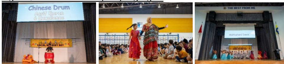
Figure 3 – Racial Harmony Day Highlights