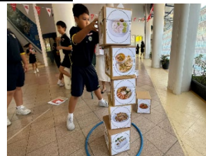
Learning through games during recess

On 8 August, the National Day celebration began with an observance ceremony and parade, where student leaders and Red Cross members led the school in the singing