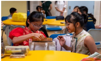
Exchange of gifts between students