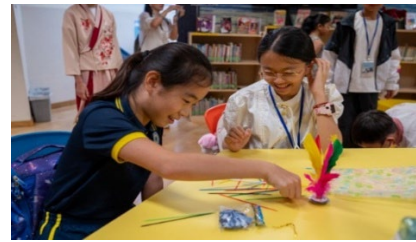
Social Studies lesson with Foshan students