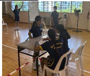
A student approaches the polling officers (prefects) to collect a ballot slip