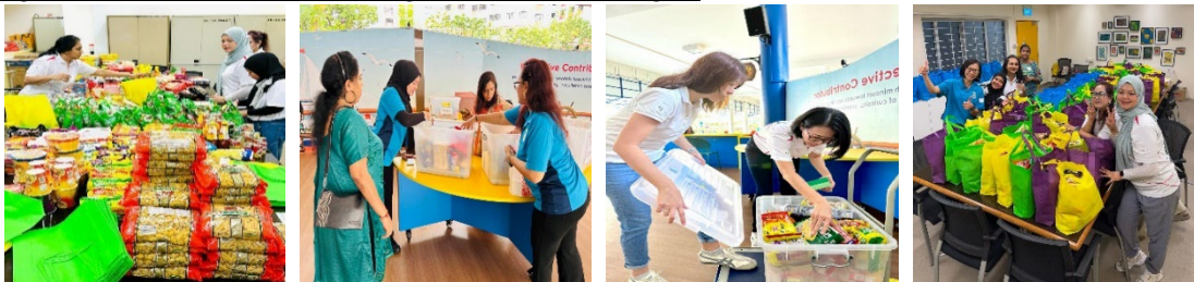
Figure 1 – Our PSG Preparing the Care Packages

9. Book Week . Held from 14 to 17 April, the MK children engaged in various activities, including learning values from fables, enjoying storytelling by PSG members in outdoor settings, watching theatre performances and expressing thoughts through drama. The week concluded with each class presenting a performance at the Media Resource Library (see Figure 2 ).