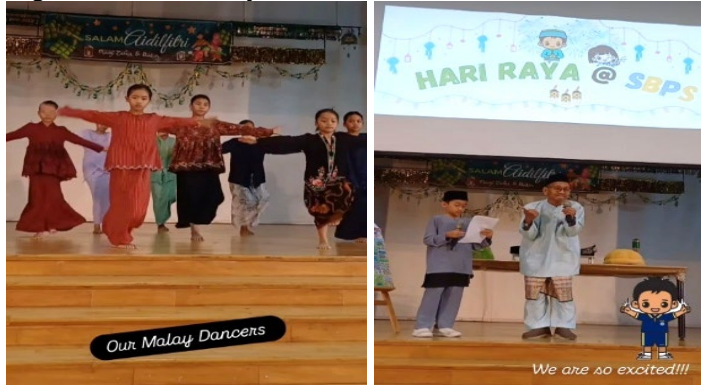
Figure 9 – Hari Raya Celebrations

18. International Friendship Day (IFD). IFD serves as a meaningful platform to foster mutual understanding, respect and appreciation for the diverse cultures and communities that make up our society and the world at large. We commemorated IFD on 9 April 2025 with an assembly programme comprising an interactive drama on encouraging positive social interactions across communities and in school, aimed at promoting values of mutual respect and working towards positive social impact. Traditional games try-outs were also organised during recesses (see Figure 10 ).