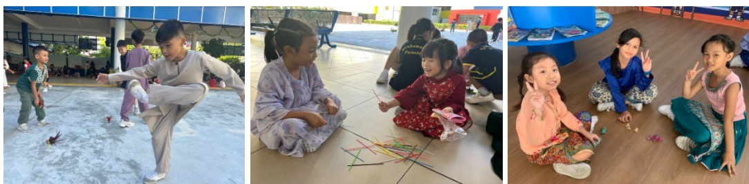
Figure 10 – Students Trying Out Traditional Games During IFD

18. International Friendship Day (IFD). IFD serves as a meaningful platform to foster mutual understanding, respect and appreciation for the diverse cultures and communities that make up our society and the world at large. We commemorated IFD on 9 April 2025 with an assembly programme comprising an interactive drama on encouraging positive social interactions across communities and in school, aimed at promoting values of mutual respect and working towards positive social impact. Traditional games try-outs were also organised during recesses (see Figure 10 ).