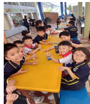
Figure 8 – Interacting with K2 Students

16. Partnership with Kindergarten. As part of the school's ongoing publicity efforts and to enhance student learning and development, the school hosted approximately 400 K2 students from 15 kindergartens between 7 and 29 April. The structured programme included a school tour and a Lunch with Buddy activity, where lower primary students guided the younger children through school routines and shared their experiences (see Figure 8 ). This initiative not only familiarised the K2 students with the primary school environment but also provided service-learning opportunities for our students. The increasing number of requests from kindergartens beyond Sembawang reflects the success of this programme, and we are continuously looking into ways to strengthen it.