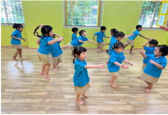
Children immersing in different characters during the drama workshop