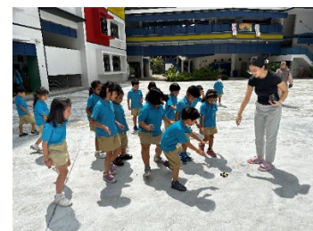
Learning how solar cars could move when placed under the sun

12. World Red Cross Day (WRCD) . WRCD is commemorated to honour the unwavering spirit of voluntary service and compassion exemplified by Founder Henry Dunant. To mark WRCD 2025, SBPS Red Cross CCA participated in the celebration of the 73rd anniversary of Singapore Red Cross Youth, themed "Empowering Youth for Humanity", held on 12 April at Hougang Secondary School. Event highlights included welcoming new members through the Enrolment Badge Pinning Ceremony and celebrating achievements of Red Cross members.