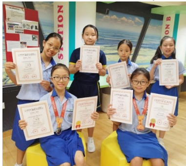
Results of Preliminary Competition