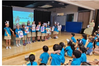
K2 Dolphin reenacting the story of The Two Goats