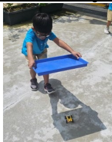
Learning how calculators and solar cars will not function in the absence of sunlight