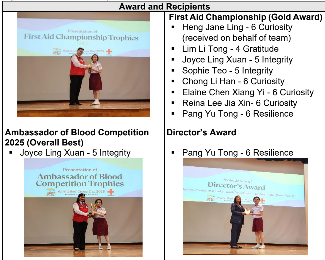
Figure 4 – Achievements by Red Cross Students

13. Istana Open House 2025 . Our Chinese dancers braved heavy downpour and challenging conditions to present a beautiful Nonya dance at the Istana Open House 2025, held on 13 April. We thank our dancers and the accompanying teachers for their dedication (see Figure 5 ).