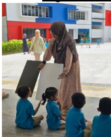
Discovering that black boards retain more heat

11. Earth Day . The theme this year is 'Our Power, Our Planet'. The children explored the solar panels around them and learnt how solar energy can be converted to electricity (see Figure 3).