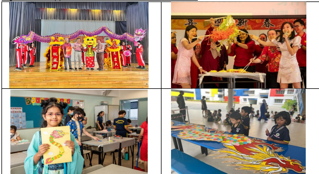
Figure 6 – Snippets of Lunar New Year Celebrations

13. Lunar New Year Celebrations. Our school celebrated on the eve of the Lunar Year with a concert comprising performances by our Chinese Orchestra, Chinese dancers and Parent Support Group. A dragon dance and traditional lion dance were also amongst the highlights of the concert. Leading up to the concert, our students were engaged in classroom and recess activities such as designing New Year cards, lantern making and dragon card making, to learn more about the Chinese culture associated with the festivity (see Figure 6 ).