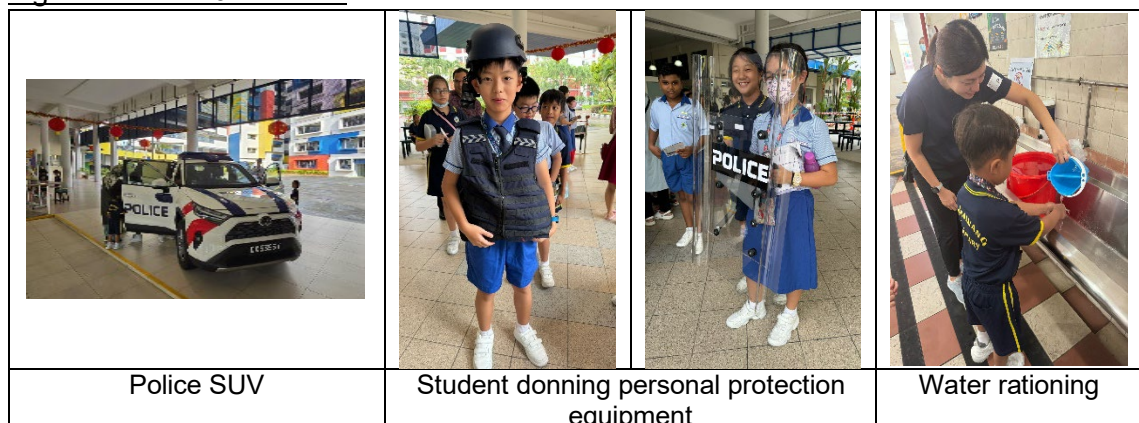
Figure 1 – TD 40 in SBPS