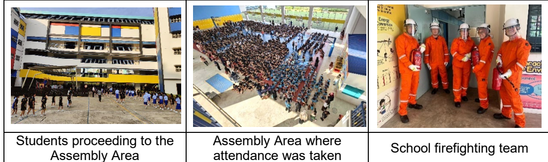
Figure 2 – SBPS READY!

5. Safe Environment. The school has installed rain breakers at the canteen/bookstore area to mitigate wet floors at student commute spaces in the event of a downpour (see Figure 3 ). In school, we will continue to address potential safety concerns through infrastructure enhancement so as to provide a safe and conducive environment for our students and staff. In addition, we will also continue to inculcate in our students a safety mindset and to embrace safety in all activities, structured or otherwise.