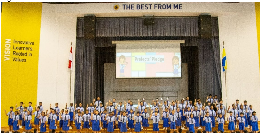
Figure 4 – Prefects of SBPS

11. Singapore Youth Festival (SYF) . The biennial SYF Arts Presentation is a performance and benchmarking platform that offers opportunities for student performers to learn and improve their respective artistic talents through feedback from industry professionals. Our Visual and Performing Arts CCAs, namely Chinese Orchestra, Chinese Dance, Malay Dance, Indian Dance and Choir, will be participating in the SYF Arts Presentation held in April 2024. Parents are welcomed to view our students' performances by showing their support in person at the SYF performing venues. We will inform parents of student performers through our CCA teachers-in-charge once the SYF details of our performing dates are confirmed by MOE. We wish our student performers the very best for their respective performances.