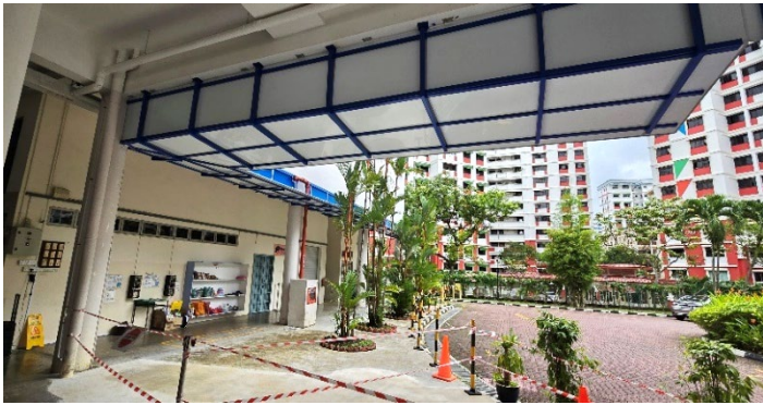
Figure 3 – Rain Breakers

5. Safe Environment. The school has installed rain breakers at the canteen/bookstore area to mitigate wet floors at student commute spaces in the event of a downpour (see Figure 3 ). In school, we will continue to address potential safety concerns through infrastructure enhancement so as to provide a safe and conducive environment for our students and staff. In addition, we will also continue to inculcate in our students a safety mindset and to embrace safety in all activities, structured or otherwise.